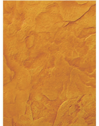
Monster Slate / S-76