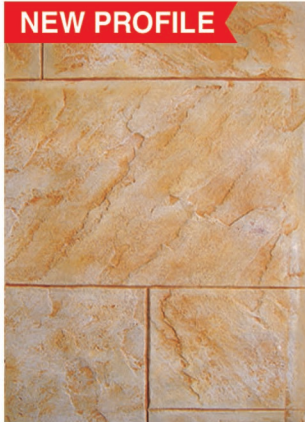
La Habra Ashler Slate S-21