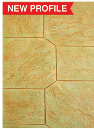
Panama Tile / S-73