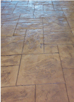
Grand Ashler Slate S-20