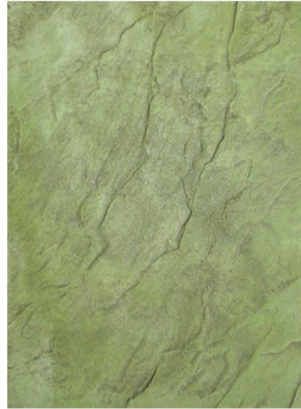
San Diego Slate / S-10