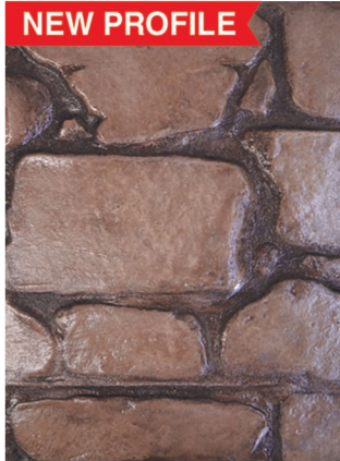
Euro Stone / S-19