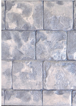
London Cobblestone S-25