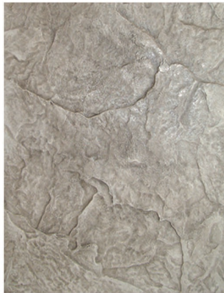
Shawnee Slate Medium S-34