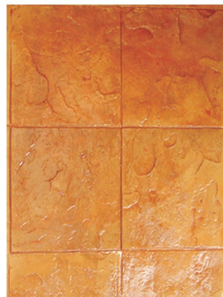
12" Cut Stone / S-57