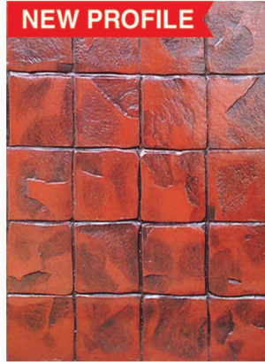
Monte Carlo Slate / S-66