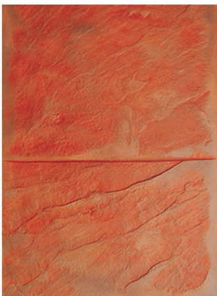
Extra Large Ashler Slate S-26