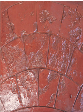
French Fan / S-69