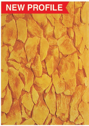
Classic Stone 18"x36" S-74