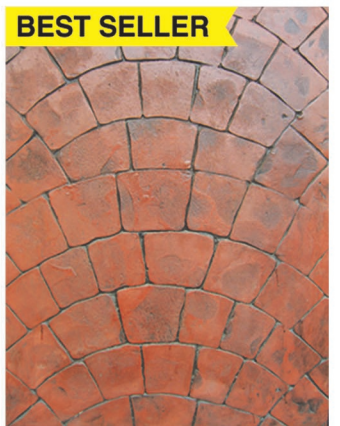
European Fan / S-66