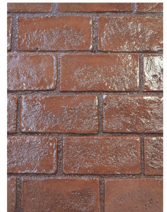
Old Brick Runningbond S-55