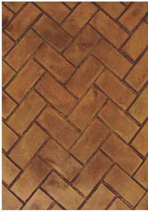
New Brick Herringbone S-52