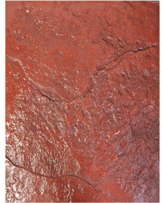
French Granite Medium S-62