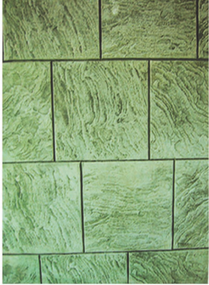
Royal Tile Runningbond S-5