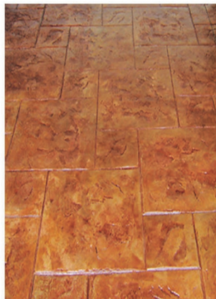
Opa Locka Stone / S-56