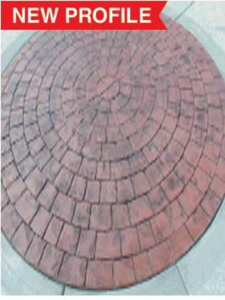
4"X4" Slate Cobblestone Circle / S-66