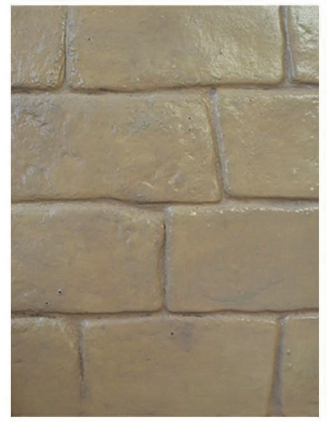
Old English Cobblestone S-82