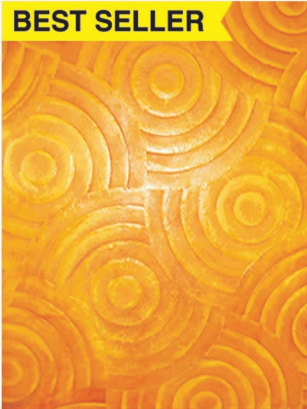
Reflection / S-45