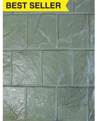
6"x6" Slate Runningbond S-79