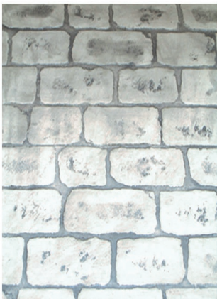
UK Cobblestone / S-30