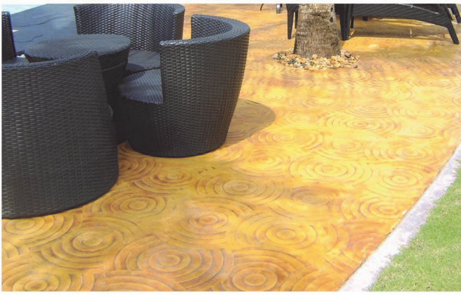
Reflection / S-45