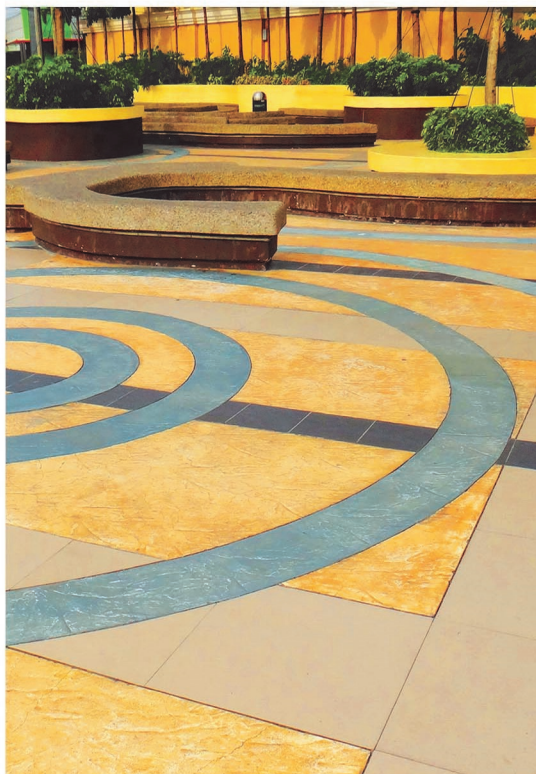
Shawnee Slate Medium / S-34 / S-76