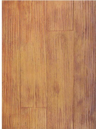
Pacific Boardwalk / S-16