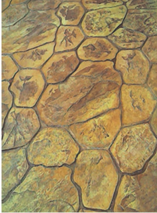
Split Rubblestone / S-44