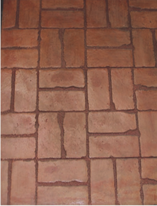
Old Brick Basket Weave S-55