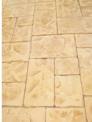
Ashler Slate / S-24