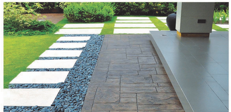
Grand Ashler Slate / S-20