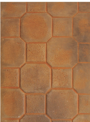
Cobble Paver / S-77